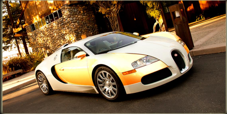
Vehicle in Image installed with SPH 65%.

PhotoSync™, also rejects 99.5% of ultraviolet rays, which means decreased fading of interior components as well as protecting occupants' skin from this harmful radiation.